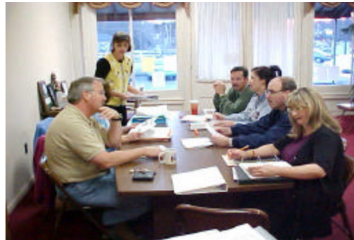
Bell Buckle Park Board Meeting